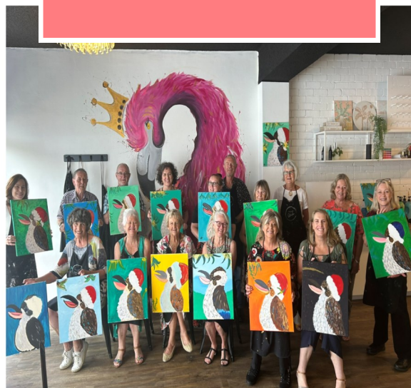
Volunteer Christmas / Thank you party