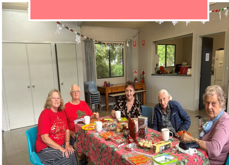
Craft Christmas morning tea